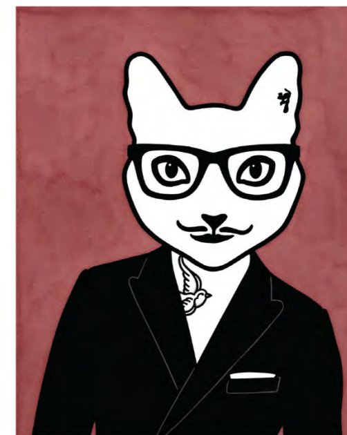
Olivier 2015 hand coloured linocut 47 x 38 cm edition 23