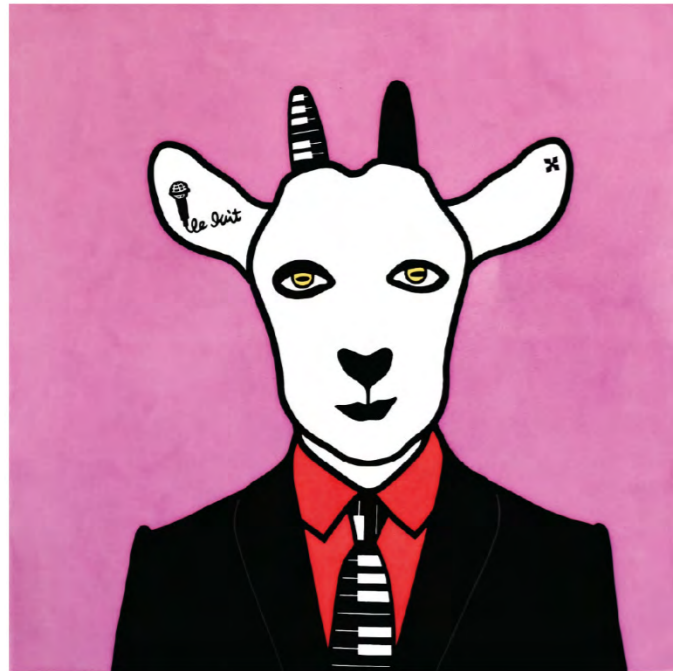
Pascal 2017 hand coloured linocut 57 x 57 cm edition 23