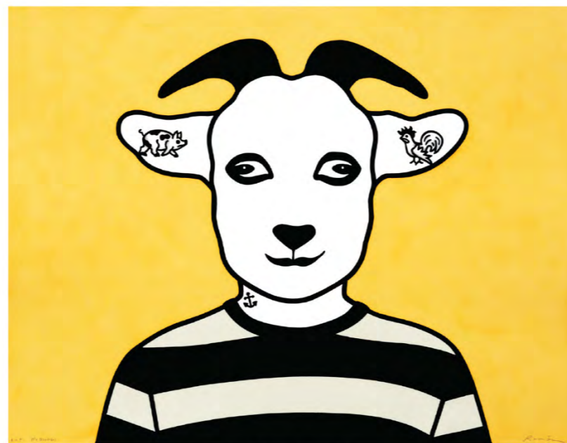
McGoohan 2015 hand coloured linocut 51 x 66 cm edition 23