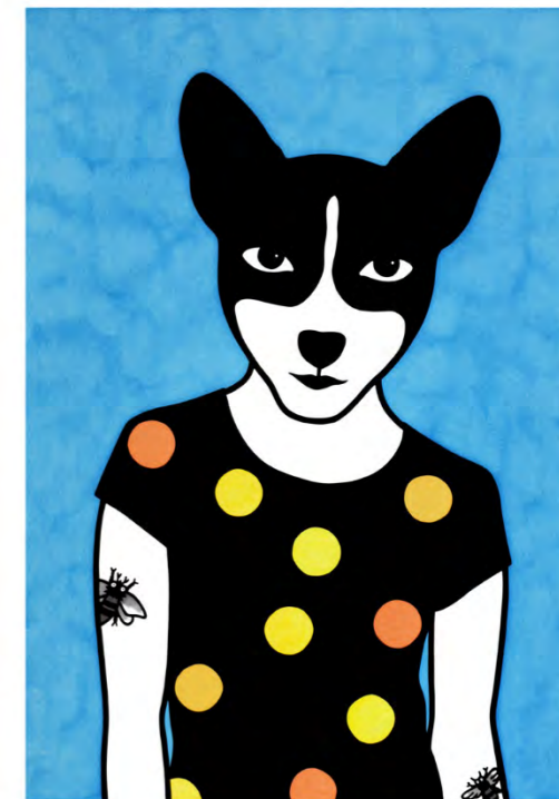
Samuil 2017 hand coloured linocut 76 x 56 cm edition 9