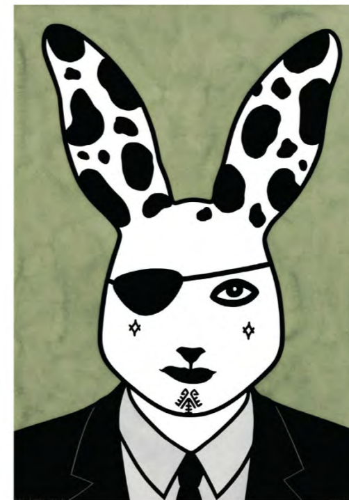
Lovely George 2015 hand coloured linocut 67 x 47 cm edition 23