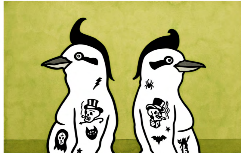
Wayno and Bazza 2018 hand coloured linocut 32 x 50 cm edition 17