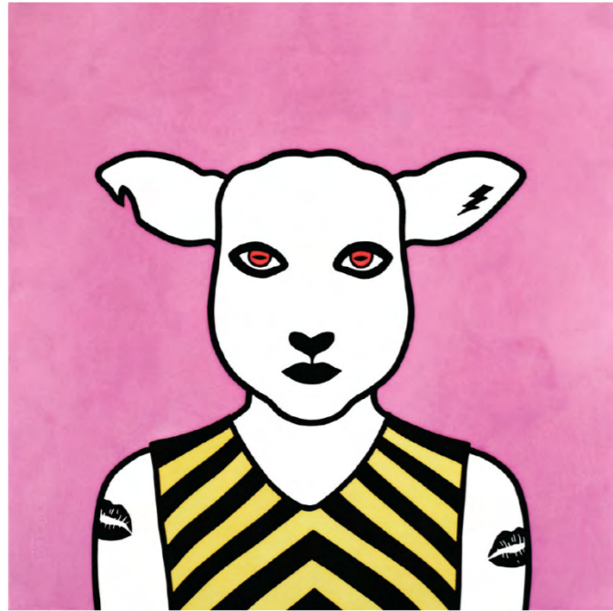
Nastja 2017 hand coloured linocut 57 x 57 cm edition 23