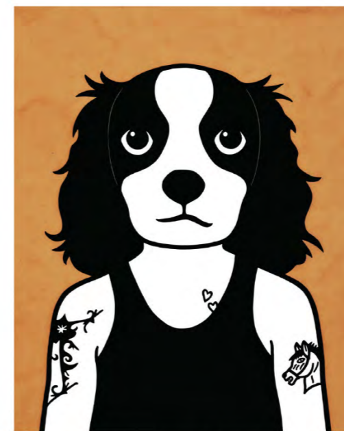
Jersey 2015 hand coloured linocut 45 x 40 cm edition 23